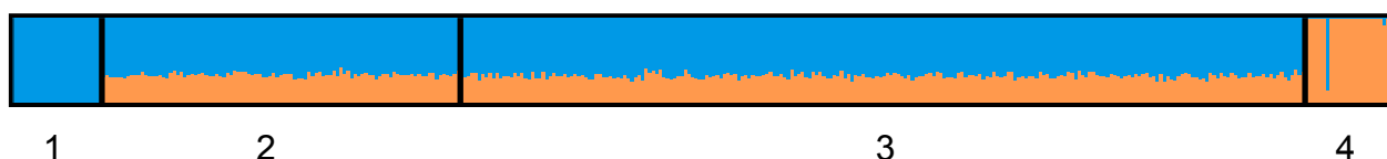
Figure 2 STRUCTURE admixture plot. STRUCTURE clearly delineates the two populations used to define the AIMs genotyped in the present study, the southern Han Chinese (1) and highland Papua New Guineans (4). Speakers of Austronesian and Papuan languages in North Maluku (groups 2 and 3, respectively) show a uniform degree of Asian admixture and no evidence of genetic differentiation. (Note the single individual with substantial Asian admixture in the highland Papua New Guinea sample).

Populations in North Maluku have been substantially impacted by gene flow from Asia. At the ancestry informative loci tested here, we estimate the overall Asian admixture fraction to be \sim 67\% (using two different methodologies). This fraction appears slightly higher on the X-chromosome, indicating a possible Asian female bias during the admixture process. In a regional context, these results mirror previously surveyed populations in eastern Indonesia. Several islands have broadly similar admixture profiles ( e.g. , Sumba, Alor and Flores), which also show a trend toward female-biased Asian admixture using the same AIMs we screened here [11]. It is